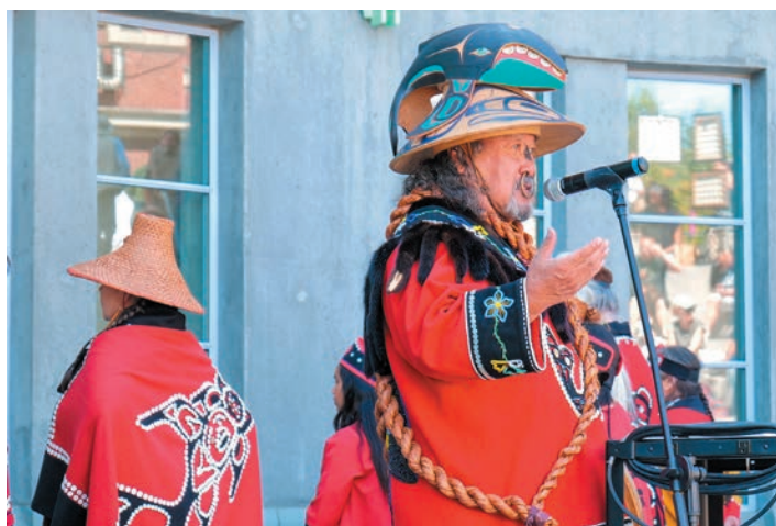
The Alaska Kuteeyaa Dancers