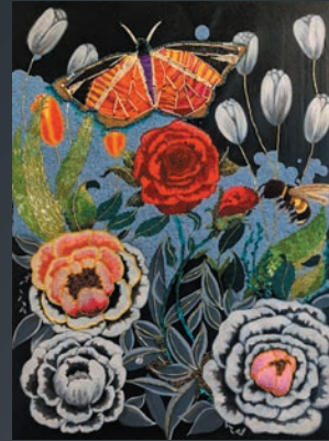
Cover Image courtesy of artist Megan McDermott